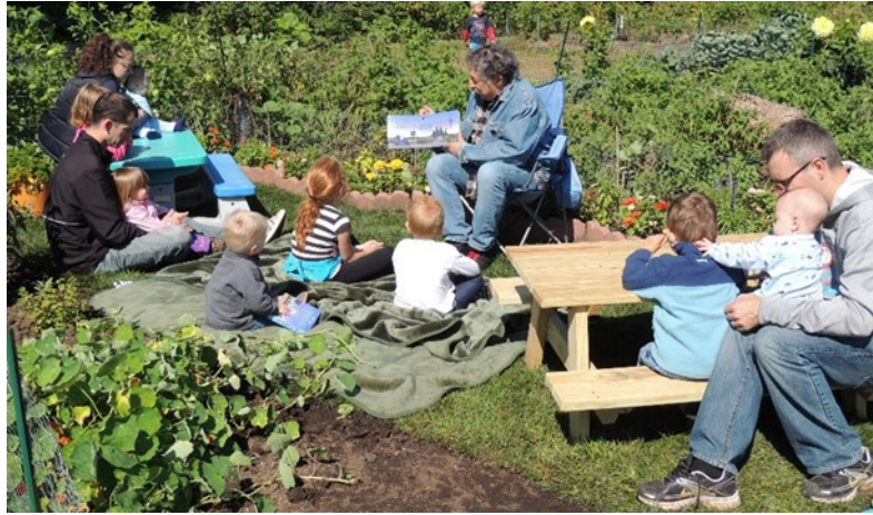
Storytime in the Garden with Mayor Paul Soglin reading "Little Blue Truck Leads the Way."

After a delicious meal, kids and adults participated in stepping stone painting, relay races, a scavenger hunt, and the popular bicycle blender smoothie station! Many