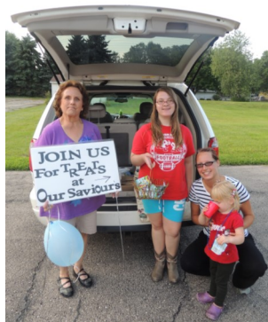
Trunk Treats Provided by Our Saviors Church