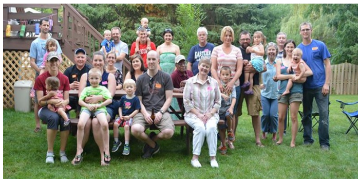
Neighborhood Night Out 2013