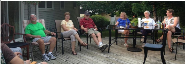
Neighborhood Night Out 2013

In lieu of a registration fee, please bring a shelf-stable food item or non-food consumable for donation to Second Harvest Foodbank of Southern Wisconsin.