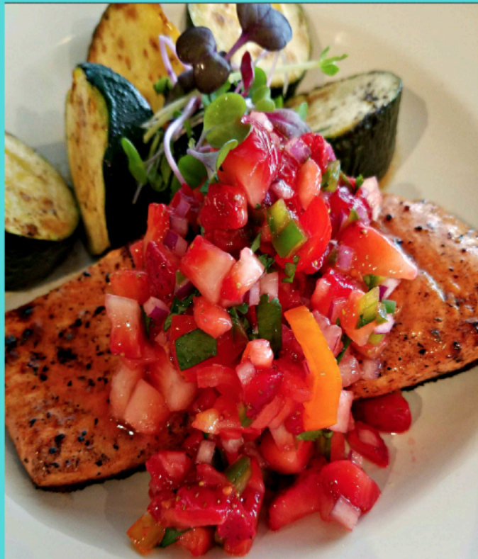
Good Food - Low Carb Cafe goodfoodmadison.com